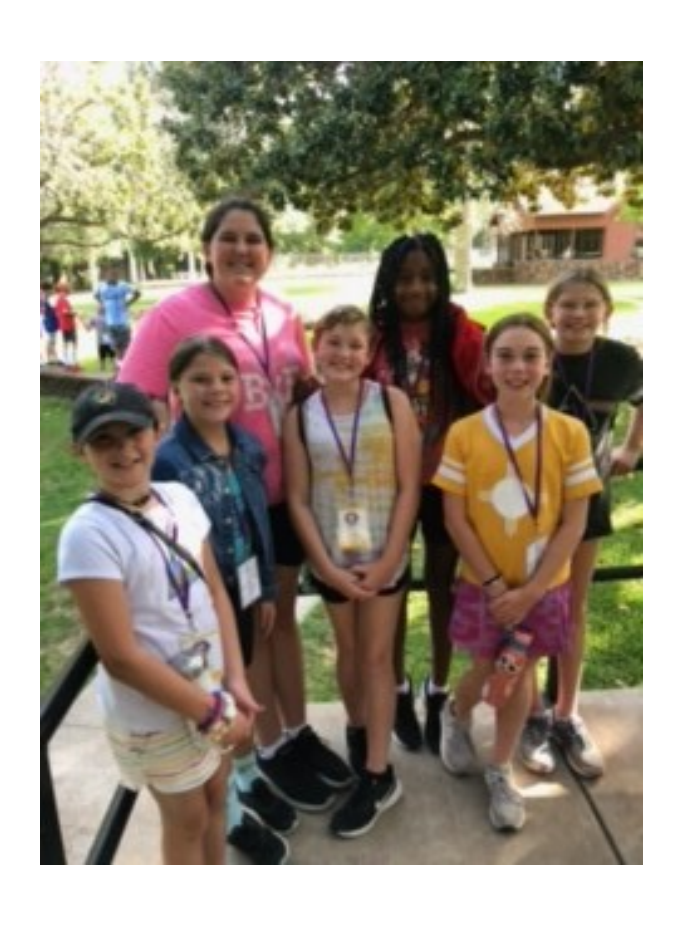
First Day at Children's Camp!