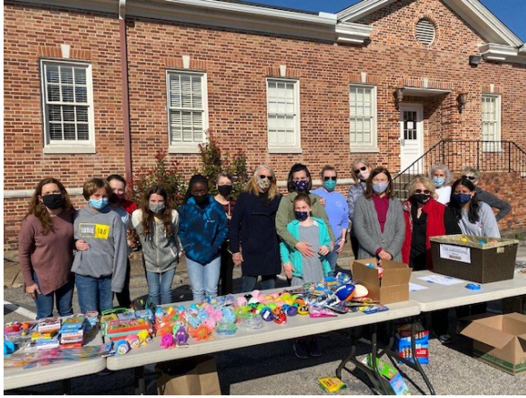
Easter Baskets for Hope Supply Co.