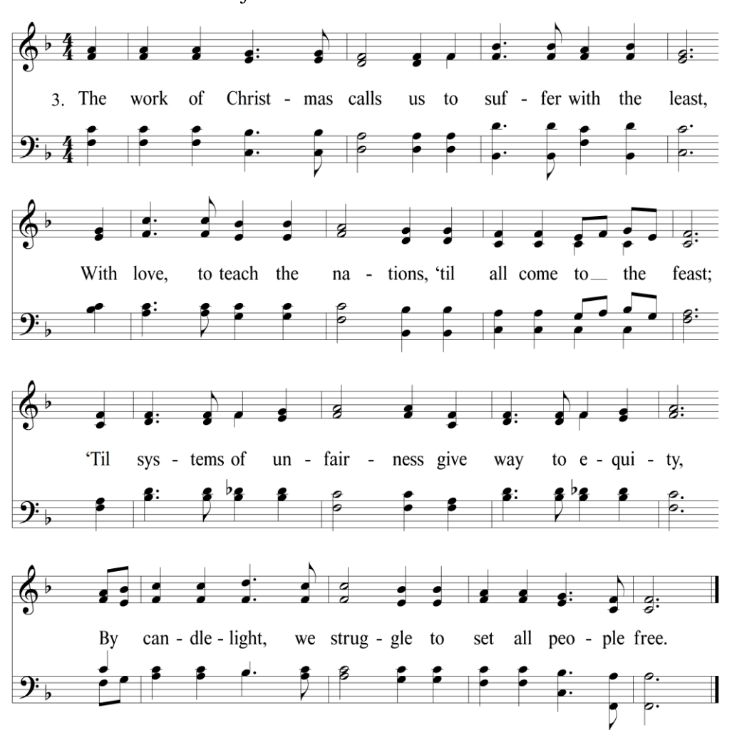
The Work of Christmas Calls Us — RUTHERFORD