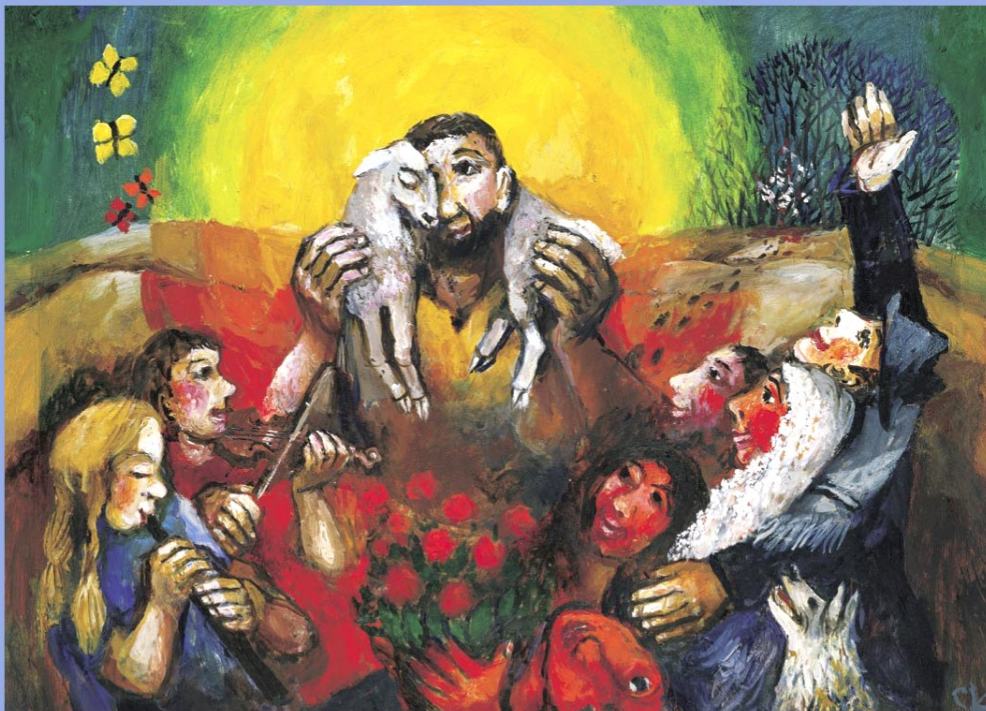
Week 3: Celebration (Der gute Hirte). © Sieger Köder. Used with permission. Produced by Logos Productions, Inc.